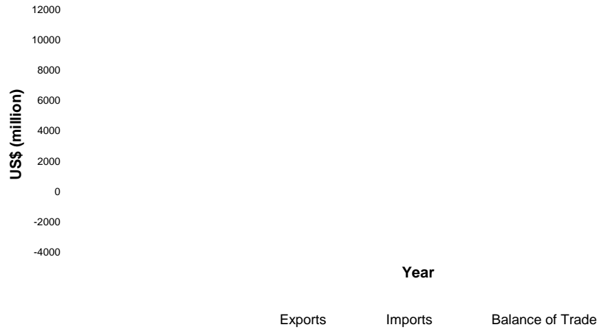
Chart 3: Balance of Trade of Bangladesh